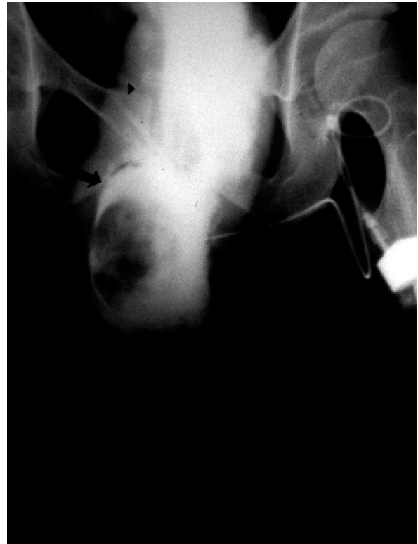
Fig. 2 – Preoperative cavernosography: Hematoma filled with contrast visualized at the right base side of the penis on the site of rupture (black arrows).

was performed via catheter using PDS 5-0 interrupted suture with previous urethral spatulation. The operation was completed by vacuum drainage. A broad spectrum antibiotic and low molecular heparin were given during the hospital stay. On the day 12 the catheter was removed.