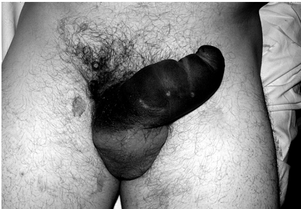
Fig. 1 – Presentation of dexter penile fracture with large edema and hematoma of the penile body. The penis angulates to the opposite side of the site of injury.

Physical examination revealed a large hematoma involving the whole penis and angulation of the penis to the left (Figure 1). Diffuse painless hematoma most prominent on the right lateral side and at the base could be palpated. In this area, hematoma appeared as soft, elastic tumefaction, painful and in size of big strawberry. Upon deeper palpation, soft and extremely painful defect was detected in t. albuginea . During physical examination, there was no blood at the meatus.